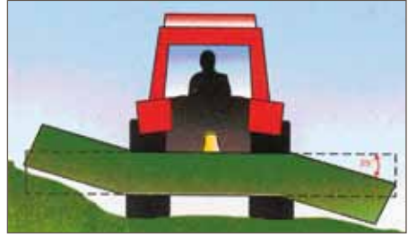
The wings float up to 25° above and below the cutting plane

The drawbar is fitted with an hydraulic ram to give additional ground clearance when the machine is in the transport position.