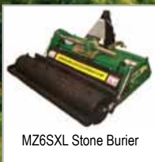
MZ6SXL Stone Burier