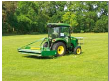
8400GR Rollermower in transport position