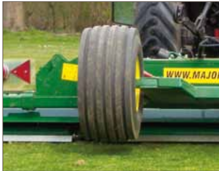
BKT Turf Tyres