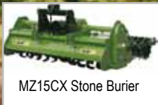
MZ15CX Stone Burier