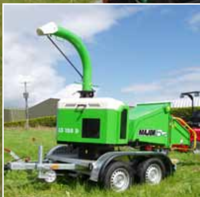
MAJOR LS 120 D Chipper/Shredder