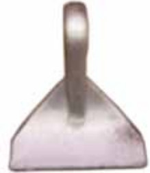
MT22 Hammer Blades