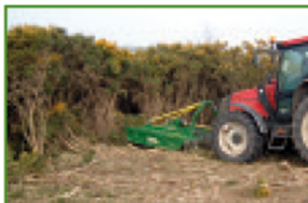
Front or Rear mounted options

The blades have an up draught aerofoil providing an exceptional air current and in turn spreading the cut material evenly. Blades are easily changed without having to remove the sprung steel stump jumper.